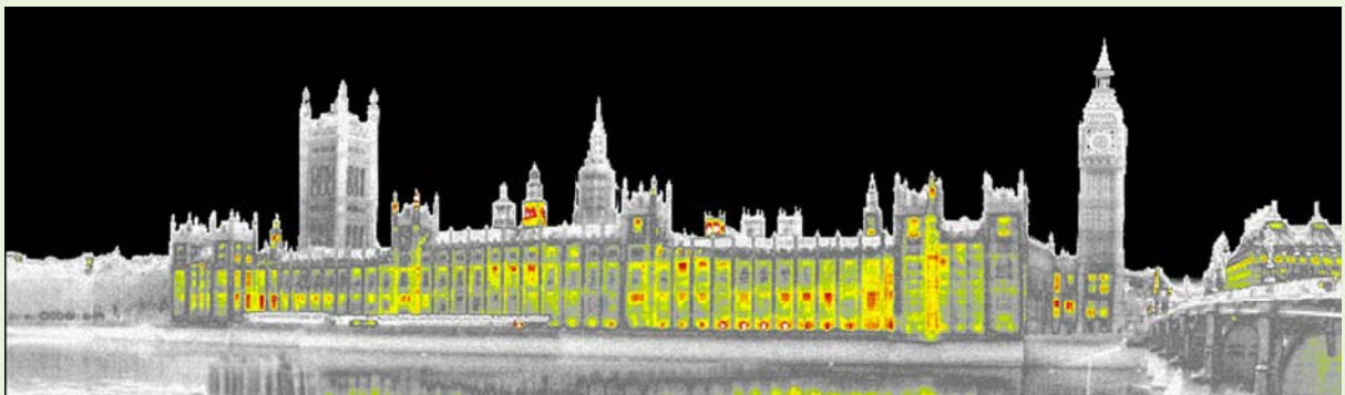
Thermal imaging of the houses of parliament

In an industrial or workplace setting thermal imaging minimises down time, repair time, labour costs and disturbance of occupant and can provide verification of a job well done.